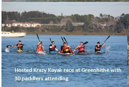
Hosted Krazy Kayak race at Greenhithe with 30 paddlers attending