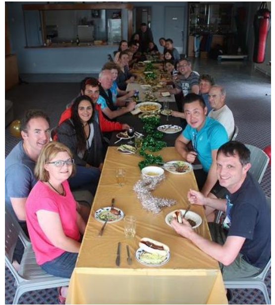
NSCC Christmas Party