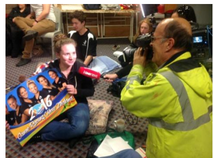
Olympic excitement & successes