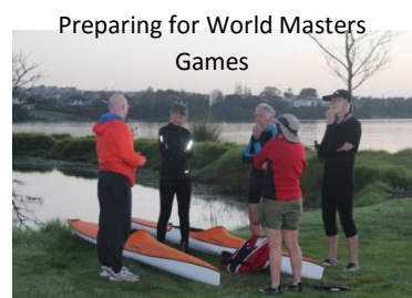
Preparing for World Masters Games

Thanks to Pub Charity we have two new Training K1s which are currently being enjoyed by our masters paddlers.