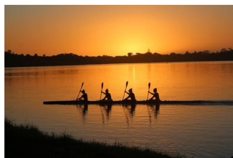
Women's Open K4