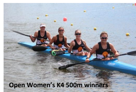
Open Women's K4 500m winners