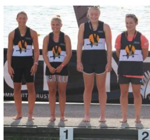
Open Women's K4 200m winners