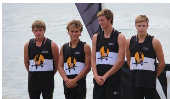
U18 Men's K4 Bronze