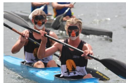
These are our new mascot