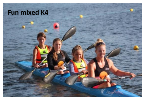
Fun mixed K4