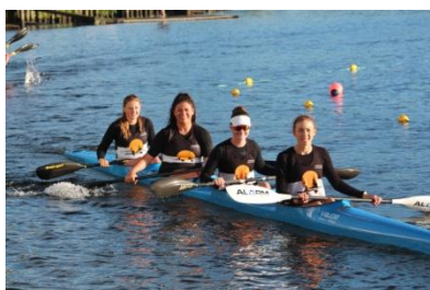
U18 Women's K4 Bronze

Lots of important info so please read to the end!